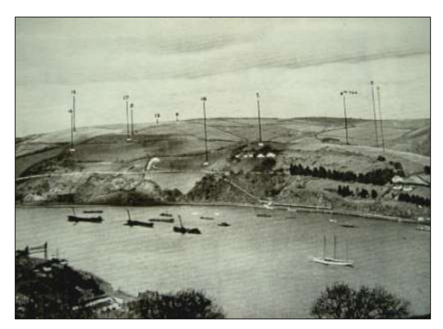
A relatively tree-less Hoodown in 1936

He cut a series of 14 foot wide roads with the lower side half held up by a 4 foot high dry stone wall, using local material. The width of the road must have been considered adequate, for at that time the