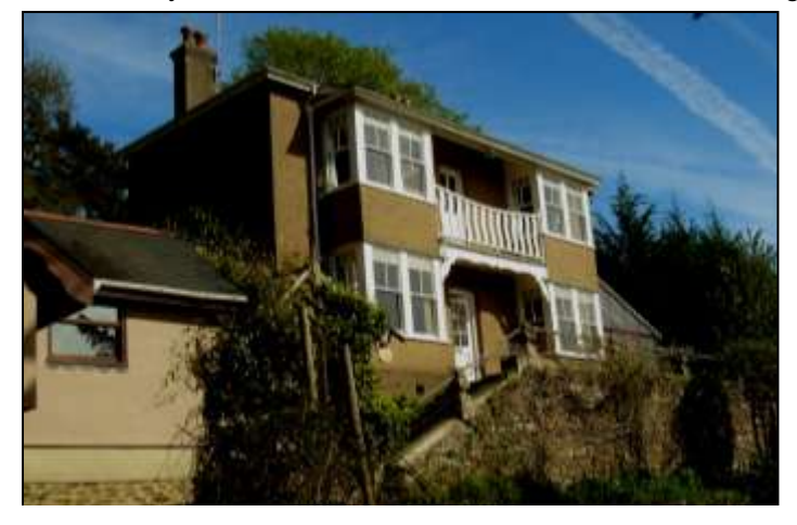
"Uplands" in 2008

He kept chickens, had a market garden and set up a small sawmill* on family land opposite the cemetery. We had over 200 chickens for their eggs and once their laying life had ended, they were